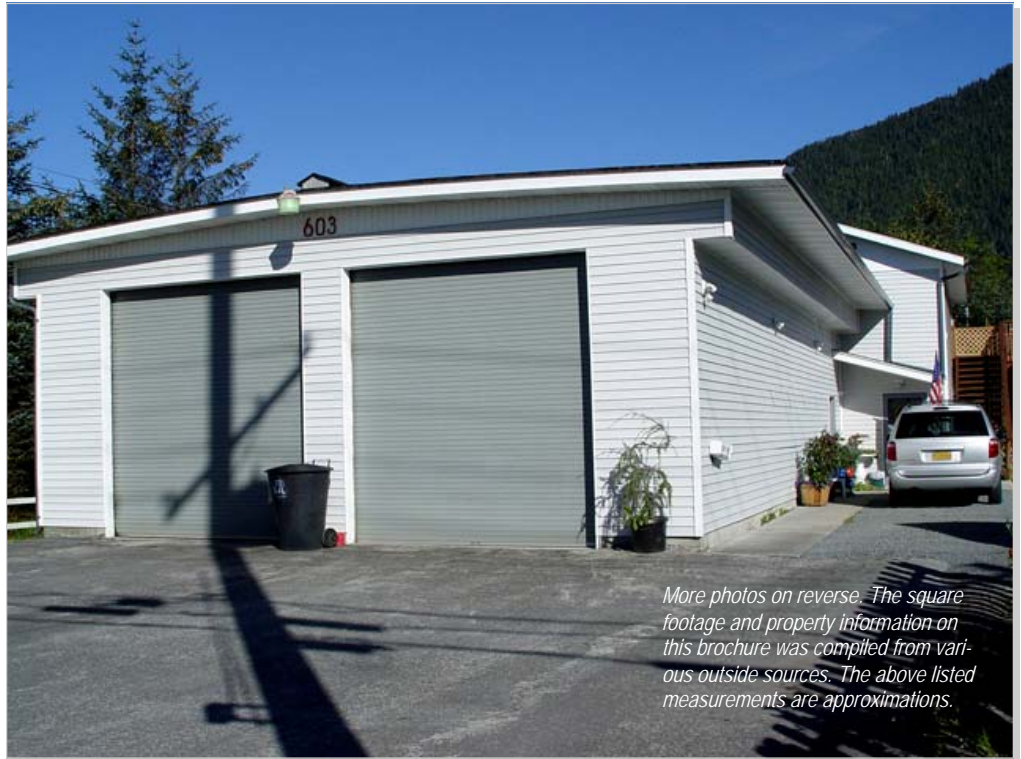
More photos on reverse. The square footage and property information on this brochure was compiled from various outside sources. The above listed measurements are approximations.